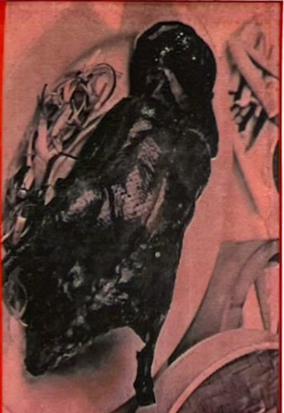
北京鴨 Peking Duck