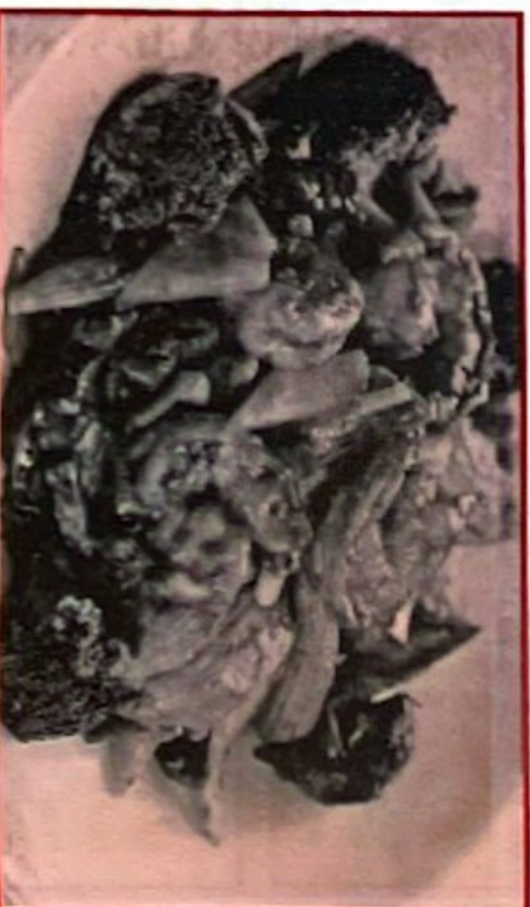
三及第 Triple Delight